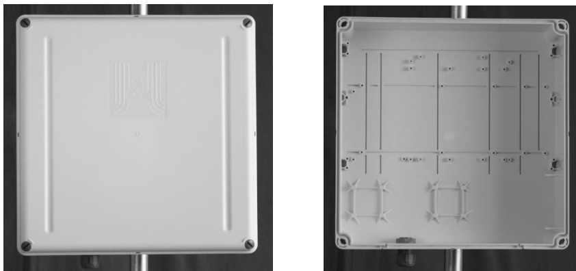
Fig. 1 GentleBOX JA – 318 MIMO - design