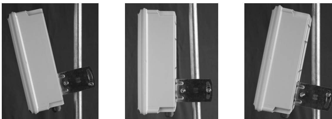
Fig. 2 Options of the tilt the antenna