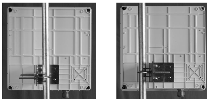
Fig. 3 Options the mounting of the bracket